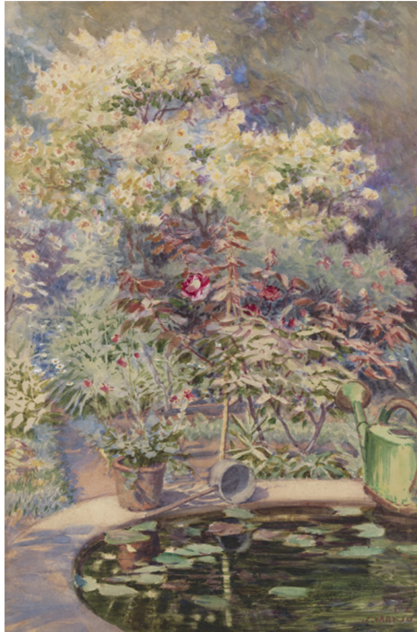
盛開 Flowering Tree 1922 水彩、紙 Watercolor on paper 21 x 33 cm 捐贈 Donation 2022.0009.007