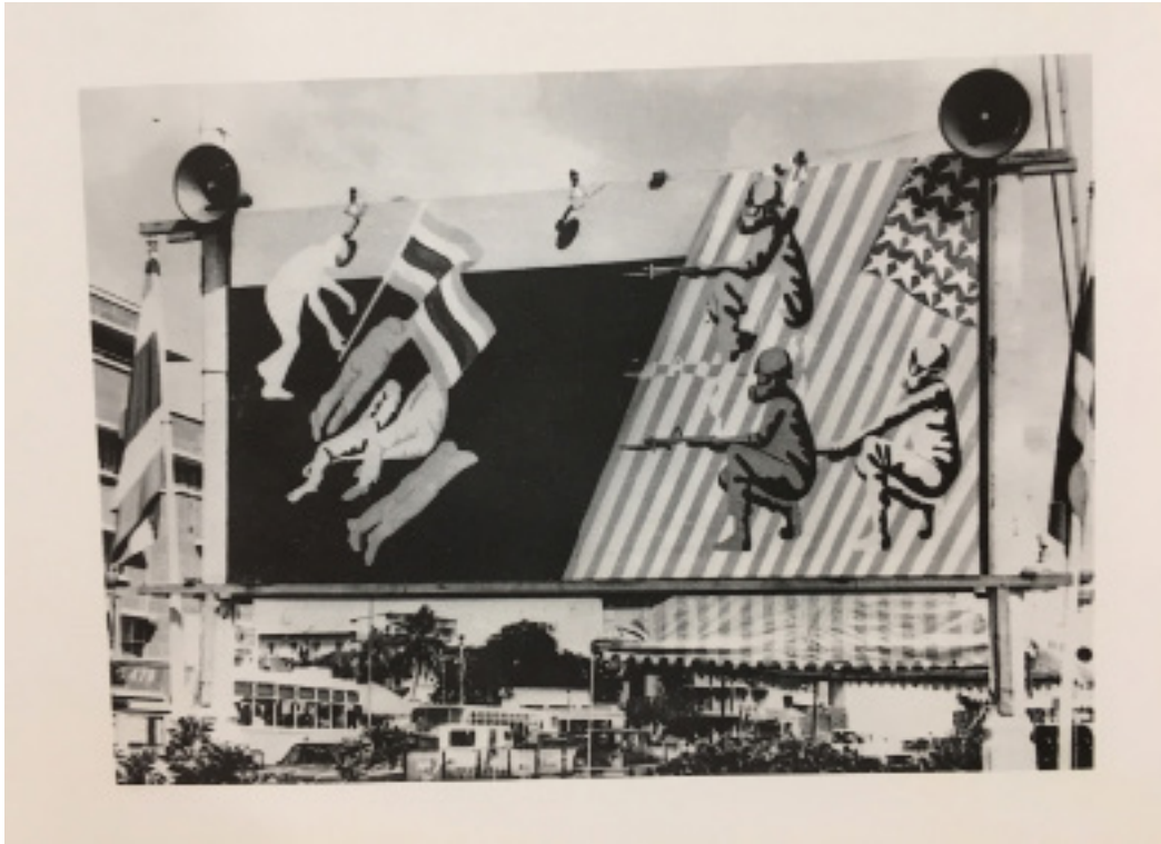
Fig. 5 The Artists' Front, Thailand exhibition of paintings, posters, murals and banners at the Rajadamnern Avenue, Bangkok

Singhasari empire in Java. It was believed that whoever married Ken Dedes would destine to kingship. Ken Dedes' sacred powers defined by her pure beauty and sexuality are given a vulgar reinterpretation by Jim Supangkat. The meaning conveyed by the cartoon-graffiti part of Ken Dedes adopts a system of depiction based on cartoons that juxtaposes with the sculptural head that conveys a different system of representation derived from Hindu-Buddhist iconography. The combination of two different and incongruent systems of representation in one single artwork produces a new mode of representation that provokes the viewer to think critically about the differences ways in which the real was represented across time and cultural contexts.