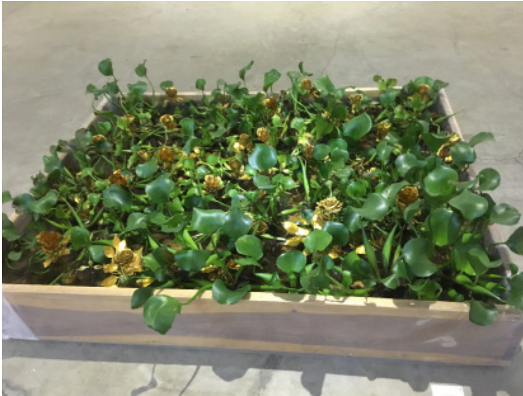
Fig. 1 Siti Adiyati Enceng Gondok Plastic, water hyacinth 1979 Collection of Artist