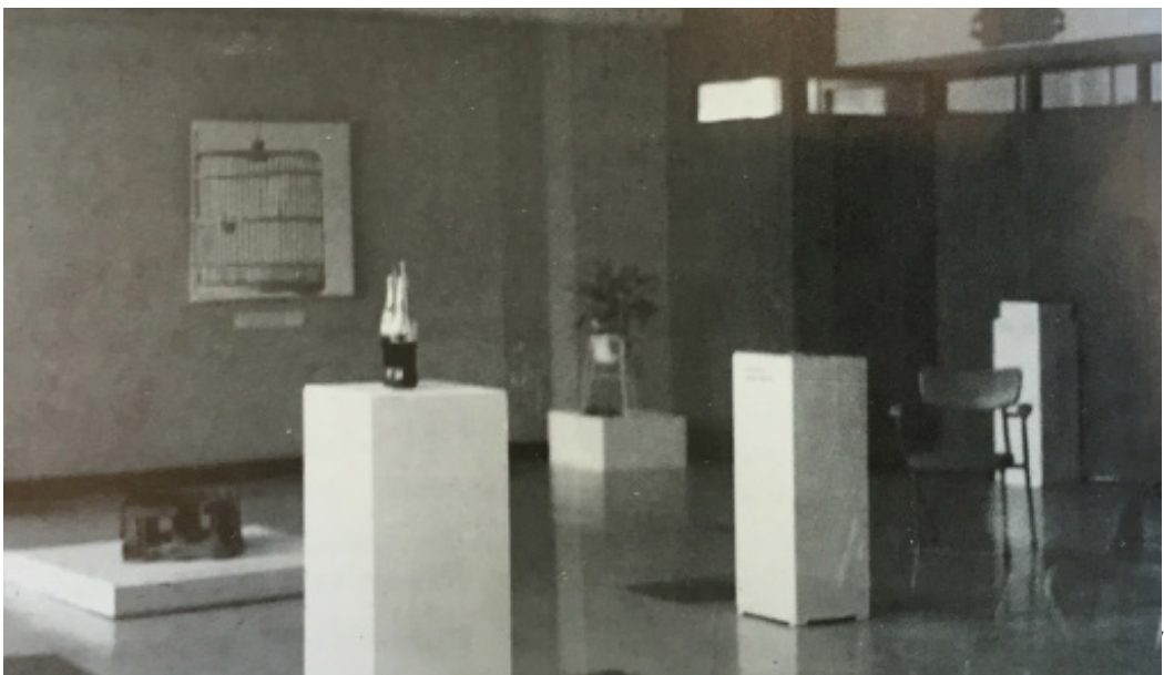
Fig. 2 Installation view of A Documentation of Experiences Initiated jointly by Redza Piyadasa and Suleiman Esa Sulaiman Esa, http://www.sulaimanesa.com/works/post-london/ , Sulaiman Esa Art Space, 2016, 05/05/2017

TMR sanctified ordinary daily objects, some of which like Siti's enceng gondok was also organic material such as human hair, a live potted plant, a chair shown as it is and two Coca-Cola bottles that are half consumed (fig. 2). Placing these everyday objects on white pedestals in a white cube gallery space immediately prompts the viewer to appreciate these everyday objects formally as sculptural artworks but draws from the Daoist philosophy of experiencing the works as events or as Krishen Jit articulates, 'live situations' rather than static and physical material objects. The hand-written label for "Randomly collected sample of human hair collected from a barber shop in Petaling Jaya"(fig. 3) pasted on the pedestal itself prompts the viewer to look beyond the apparent valueless and organic human hair that will be discarded as an ephemeral found object to