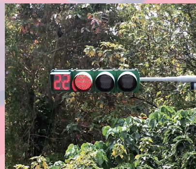
迷惑與打呼 / 2019 / 影像裝置 / 尺寸依場地而定 / Confusion and Snore / 2019 / Video Installation / Dimensions Variable