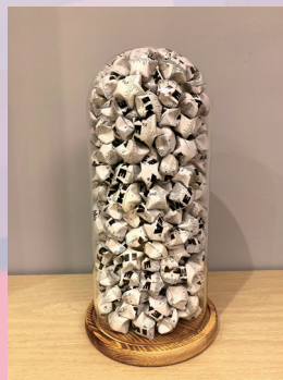
星空 / 2019 / 裝置 / 20x20x40公分 *使用免費的紙尺摺星星 Starry Sky / Installation/ 20x20x40cm *Origami star by free paper ruler