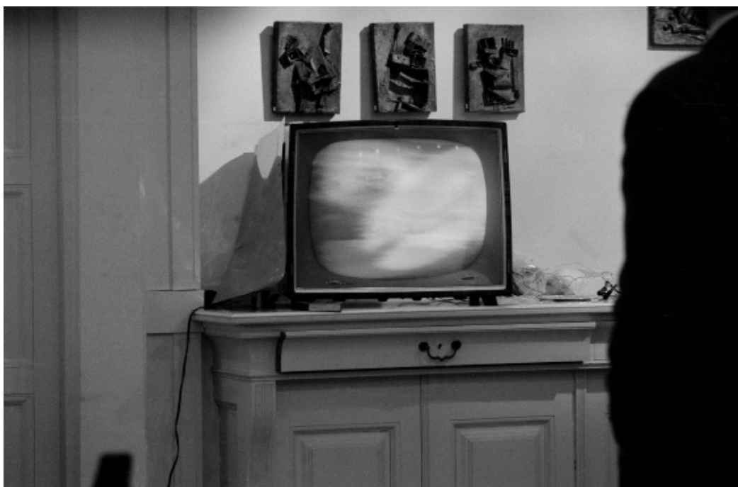
Fig. 5 Nam June Paik's Kuba TV at Exposition of Music – Electronic Television (1963).