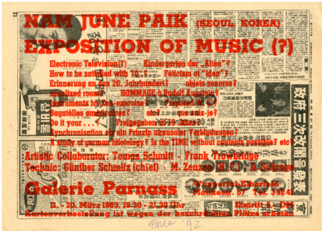
Fig. 7 Nam June Paik, Exposition of Music – Electronic Television : exhibition poster reinterpretation (1963). Erik Andersch Collection. Nam June Paik Art Center Archives. ©Nam June Paik Estate.

oppressive political situation in Korea (Shin 89-91). During the Cold War and dictator's control in Korea, freedom of speech was severely suppressed. The announcements of the subversive exhibition were printed against the backdrop, which reported people's resistance to the suppressive political situation.