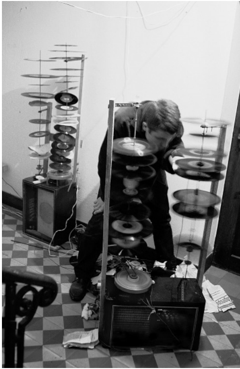
Fig. 2 Visitor at Record Schaschlik at Exposition of Music – Electronic Television (1963).