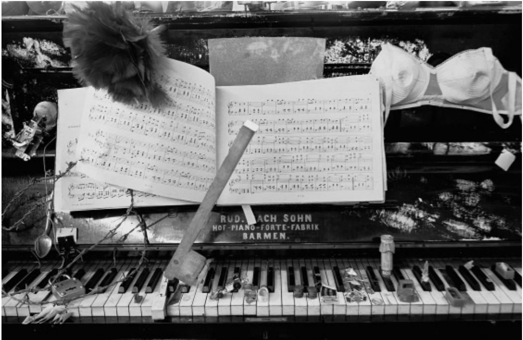
Fig. 1 Nam June Paik's Klavier Intégral , manipulated piano with various items installed at Exposition of Music – Electronic Television (1963).

“exposed the music.” He wanted to let the audience act and play by itself. Therefore, “the sounds, etc., move, the audience moves also” (1963). According to Tomas Schmit, Paik’s collaborator at that time, it was “more like a performance, a potential performance,” because gallery visitors were encouraged to participate (qtd. in Drechsler 44). On its opening, there was an extreme example of participation. Paik had a piano delivered to the gallery and place it on the floor to play it with feet. Beuys came to the show with an axe and smashed that piano with great force, which scared most people at the show. It was not planned but Beuys did it on his own. Paik did not see him destroying the piano since he was engaged in adjusting television sets in the next room (Pickshaus 97-98). Paik characterized this event as a situation wherein “the sounds sit, the audience plays or attacks them” (1963). He explored “the question of moving sounds around, or allowing the audience to move around sounds, or allowing them to produce sounds with specially designed installations” (Nyman 87).