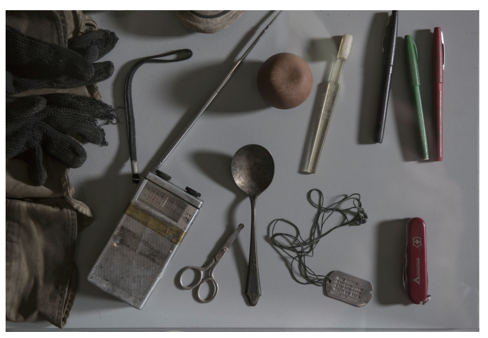
Fig 1. Installation view from "Doing Time"